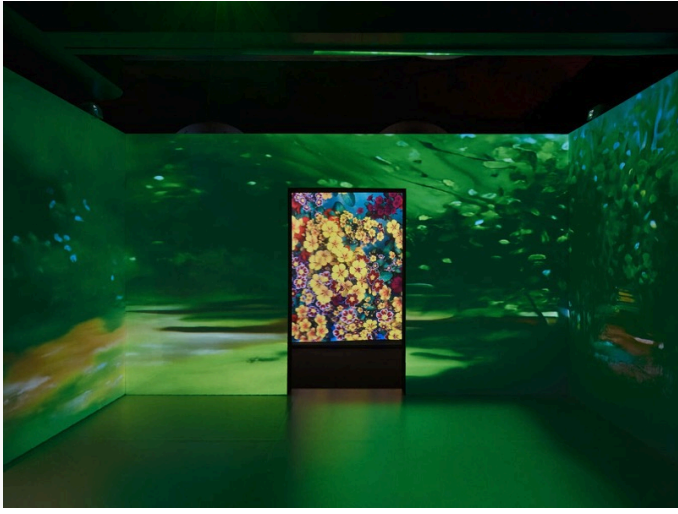
The Gardens, press image 2. 2024. Source file: DSCF6135 1340 c.