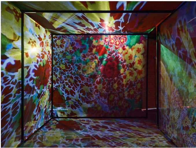
The Gardens, press image 4. 2024. Source file: DSCF6172 1340 c.