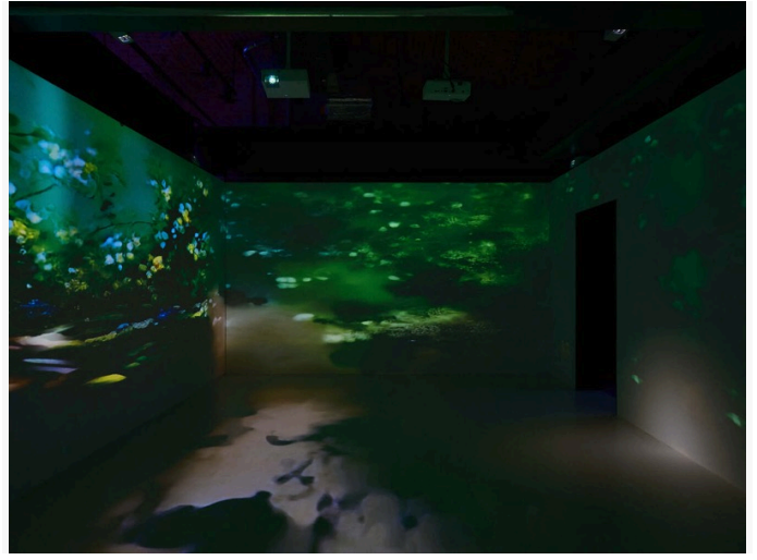
The Gardens, press image 3. 2024. Source file: DSCF6139 1340 c.