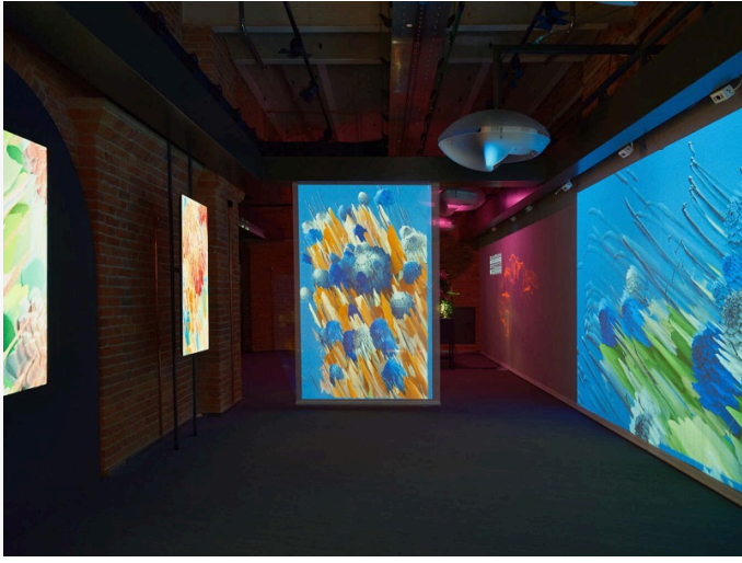
The Gardens, press image 8. 2024. Source file: DSCF6231 1340 c.