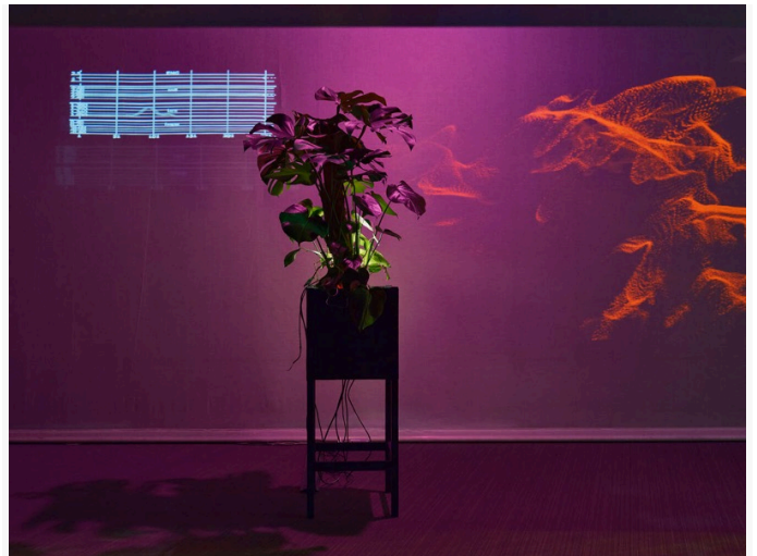
The Gardens, press image 7. 2024. Source file: DSCF6220 1340 c.