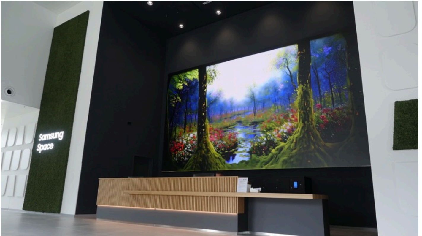
Code of Nature, press image 1. 2025. Source file: fit1 1280.

A four-chapter generative system driven by environmental data and building activity.