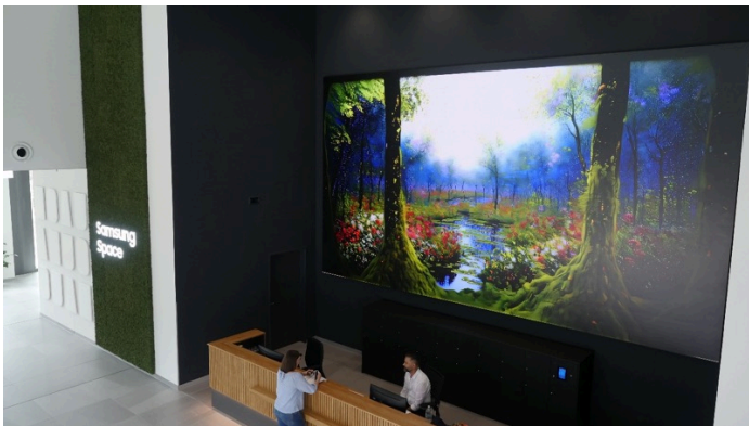
Code of Nature, press image 2. 2025. Source file: fit2 1280.