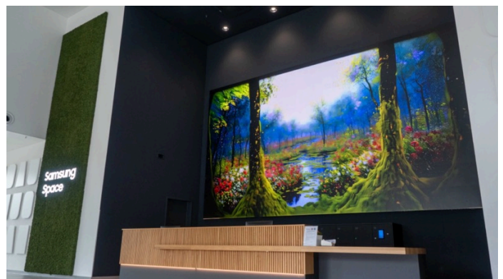
Code of Nature, press image 5. 2025. Source file: prt 640x360 1769777205 2x.