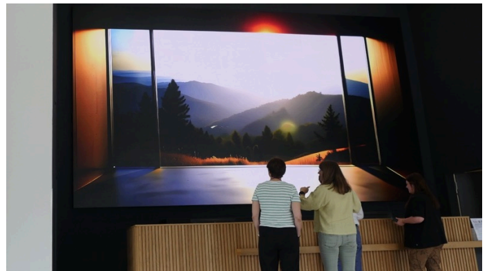
Code of Nature, press image 3. 2025. Source file: fit3 1280.